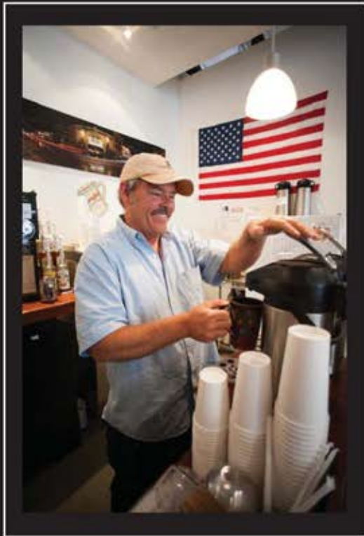
MAYOR DANA WILLIAMS